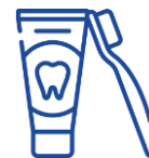
toothpaste on brush